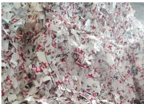
Type of Paper: Cigarette Case Stock Paper

Please find beneath the various products we supply. If you want more information and specifications, please contact our department for this business unit.