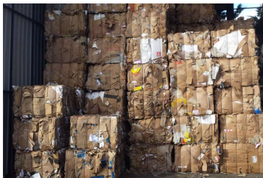
Type of Paper: OCC 95/5 OCC 95%, 5% of other paper mixed with OCC