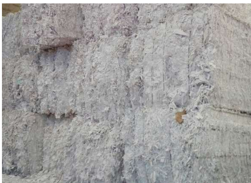
Type of Paper: White Shavings