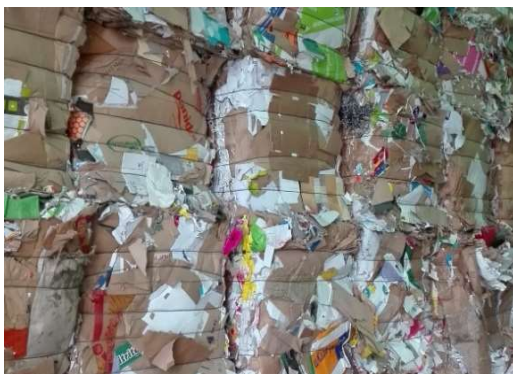
Type of Paper: OCC 90/10 OCC 90%, 10% of other paper mixed with OCC