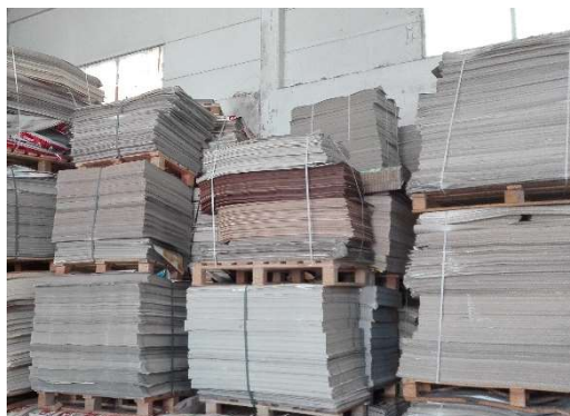
Type of Paper: Boards on Pallets