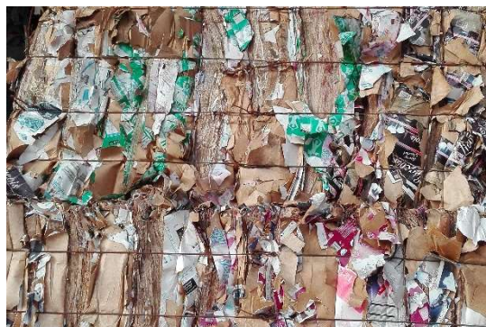
Type of Paper: KCB Kraft