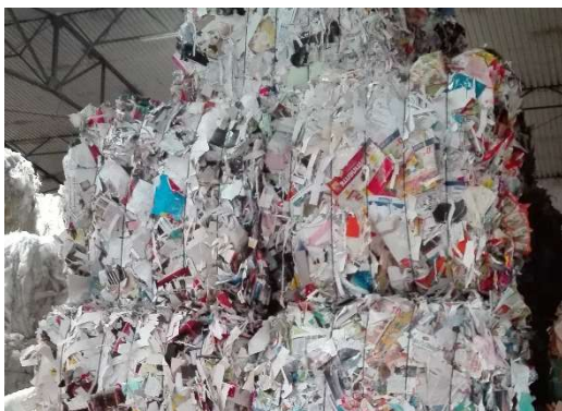
Type of Paper: Magazines & Newspapers