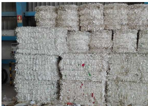
Type of Paper: Cup stock paper

Please find beneath the various products we supply. If you want more information and specifications, please contact our department for this business unit.