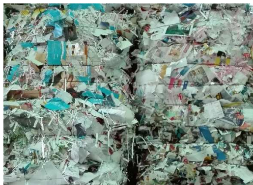
Type of Paper: Mix Printer