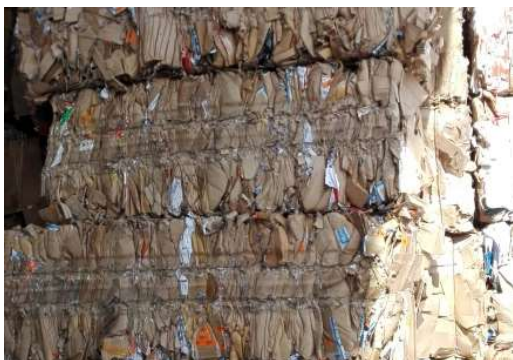
Type of Paper: OCC 98/2 OCC 98%, 2% of other paper mixed with OCC

Please find beneath the various products we supply. If you want more information and specifications, please contact our department for this business unit.