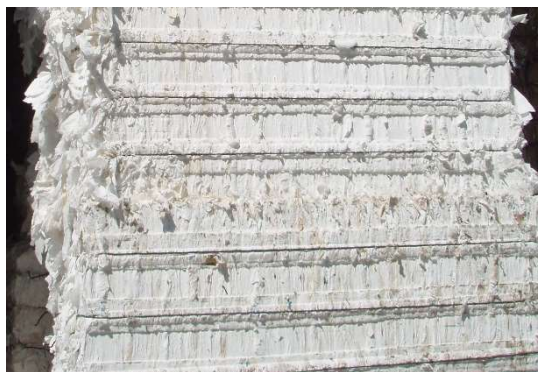
Type of Paper: Tissue Paper