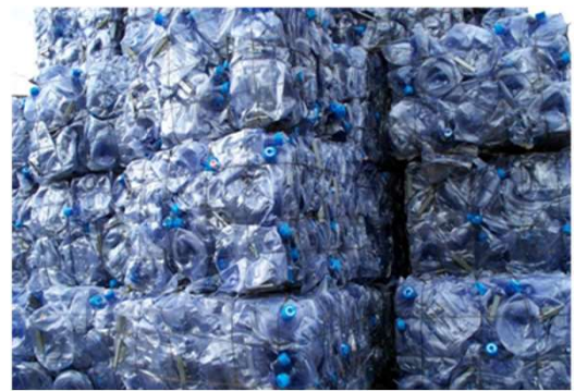
Type of plastic polymer: Polycarbonates (O 07 PC ) Common origins: Automotive industry and construction. Packaging: Big-bags