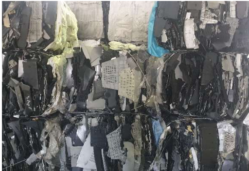
Type of plastic polymer: Polystyrene ( PS 06 ) Common origins: Computers Packaging: Bales

Please find beneath the various products we supply. If you want more information and specifications, please contact our department for this business unit.