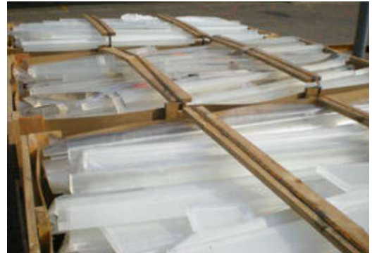
Type of plastic polymer: Poly methyl methacrylate (O 07 PMMA/Acrylic ) Common origins: Automotive industry and construction. Packaging: Big-bags