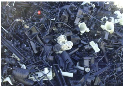
Type of plastic polymer: Polyamides (O 07 PA ) Common origins: Fibers, toothbrush bristles, fishing line, under-the-hood car engine moldings. Packaging: Big –bags